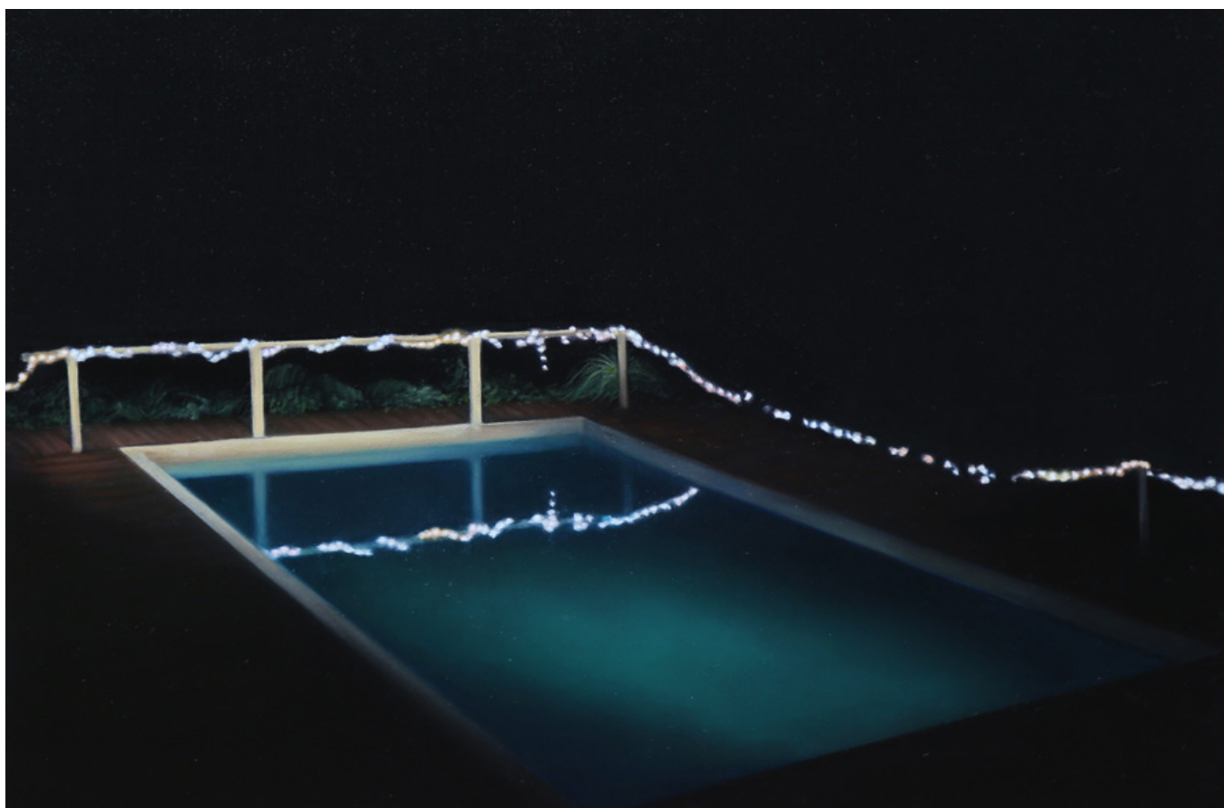
'3.10am Jacksons Road' 2015 oil on linen 35 x 48 cm $1,800