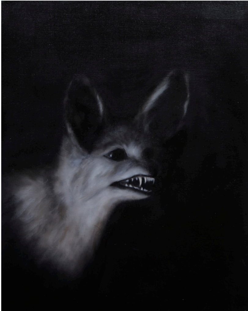
'Noctambule #1' 2015 oil on paper 48 x 43 cm $880