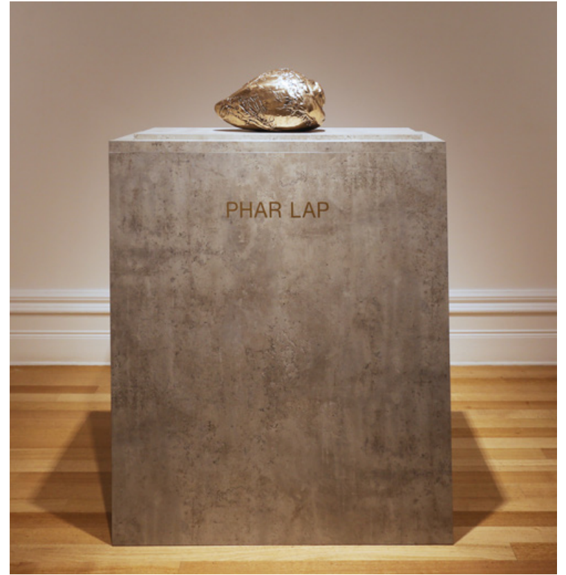
'Wonder Horse' 2017 Bronze, laminate, vinyl 140 x 100 x 45 cm with plinth Edition of 3 + 1 AP $6000 Bronze $8000 Bronze with plinth