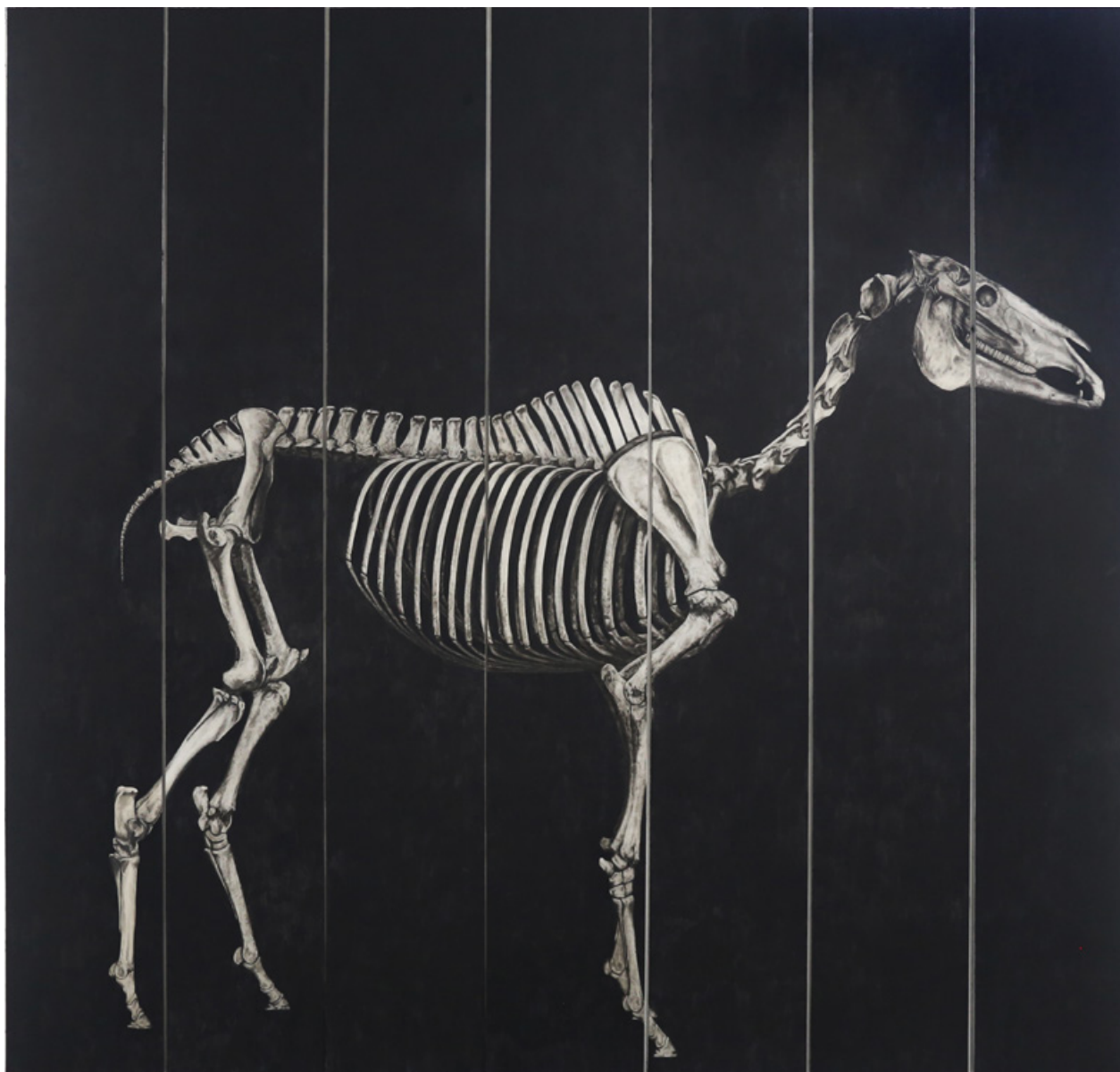
'Phar Lap: Bone' 2017 Charcoal on cement fibreboard 300 x 322 cm $4500