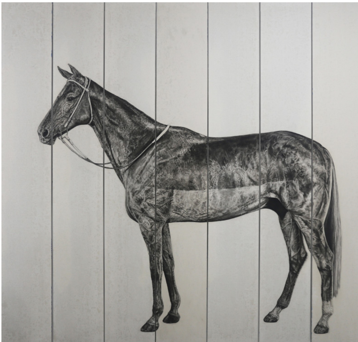
'Phar Lap: Skin' 2017 Charcoal on cement fibreboard 300 x 322 cm $4500