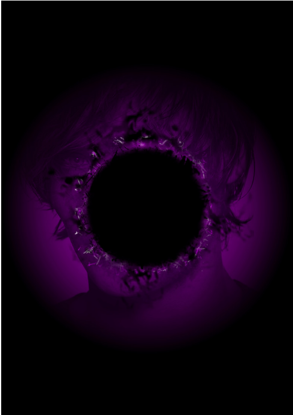
Colonial Void of Death 2017 Duratran print on Light Box 59.4 x 84.0 cm $5,000