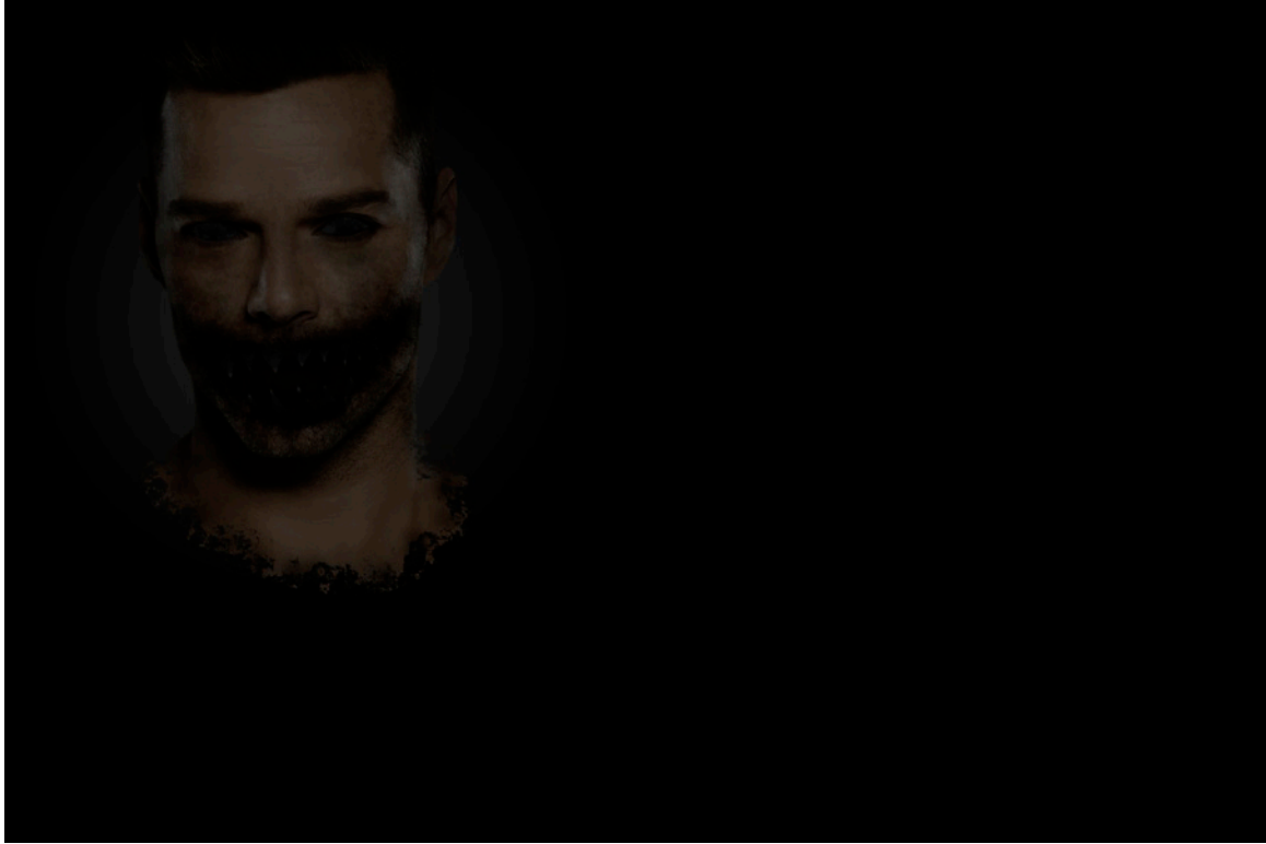
Caribbean Start of Conquest 2017 Duratran print on Light Box 73.4 x 48.9 cm $4,000