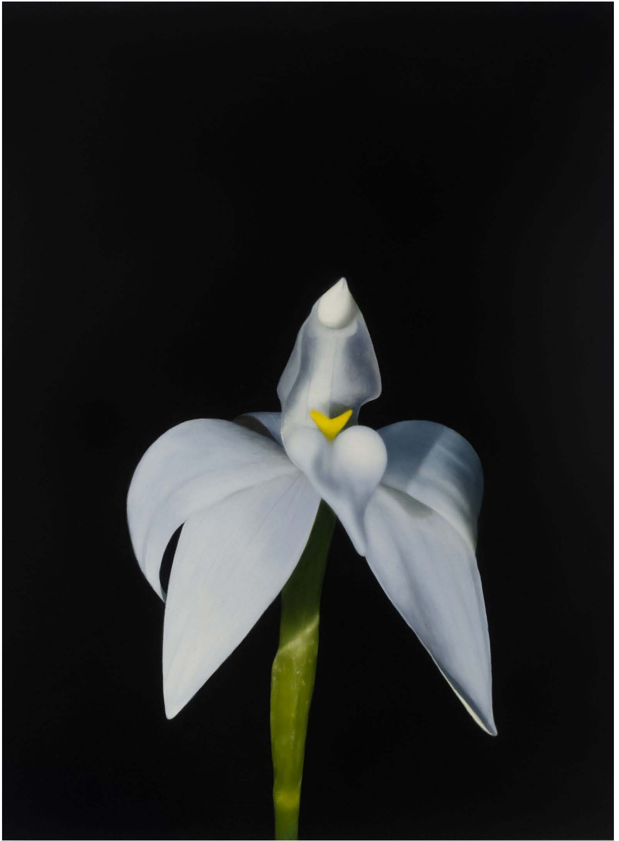
Wax-Lip Orchid, Pale form I (Caladenia Major) 2023 Oil on linen (framed) 56 x 41 cm