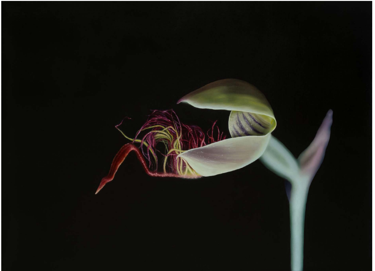
Red Beard Orchid ( Calochilus paludosus ) 2024 Oil on linen (framed) 41 x 56 cm SOLD