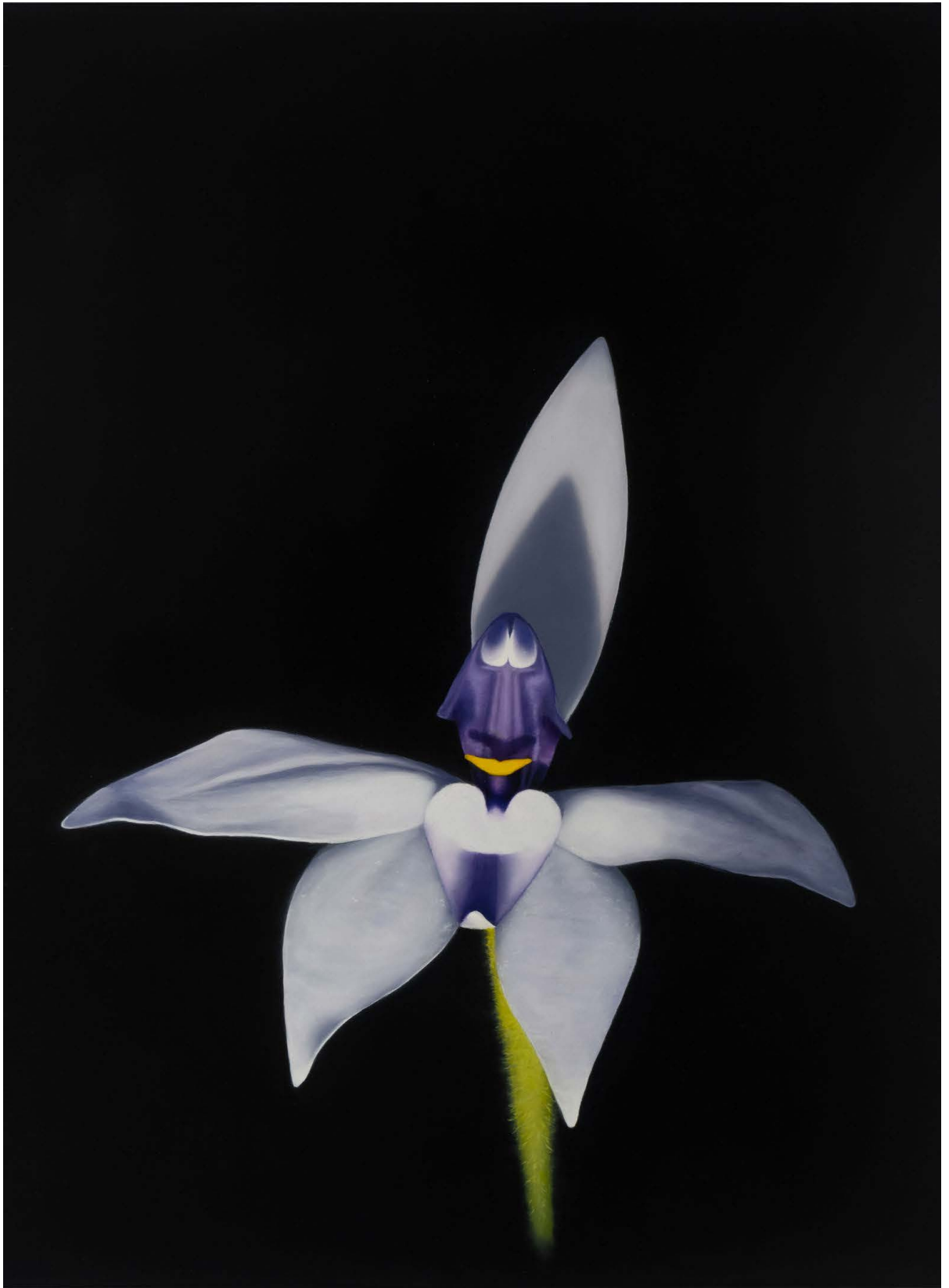
Wax-Lip Orchid, Pale form II (Caladenia Major) 2023 Oil on linen (framed) 56 x 41 cm