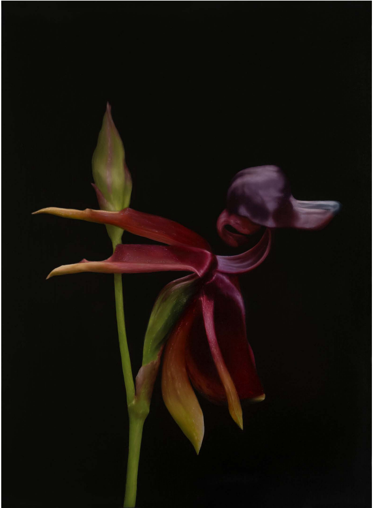
Large Duck Orchid ( Caleana major ) 2024 Oil on linen (framed) 56 x 41 cm SOLD