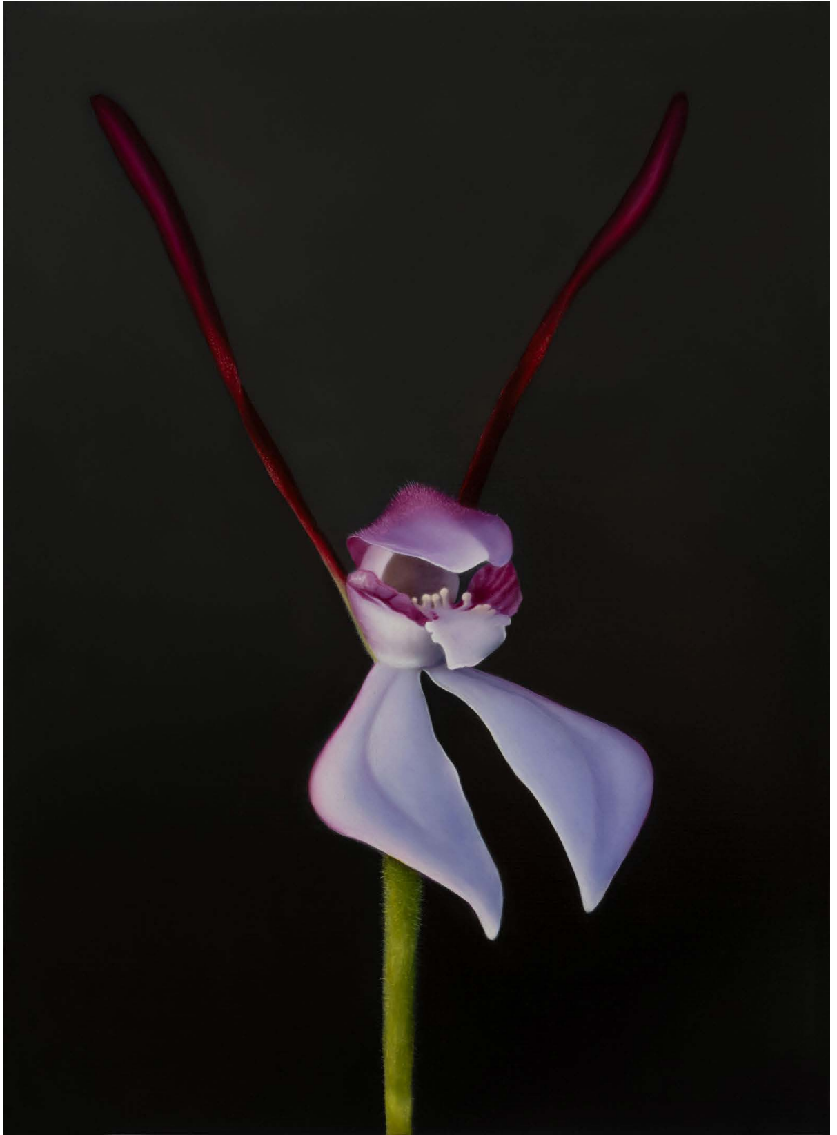
Hare Orchid ( Leptoceras menziesii ) 2024 Oil on linen (framed) 56 x 41 cm