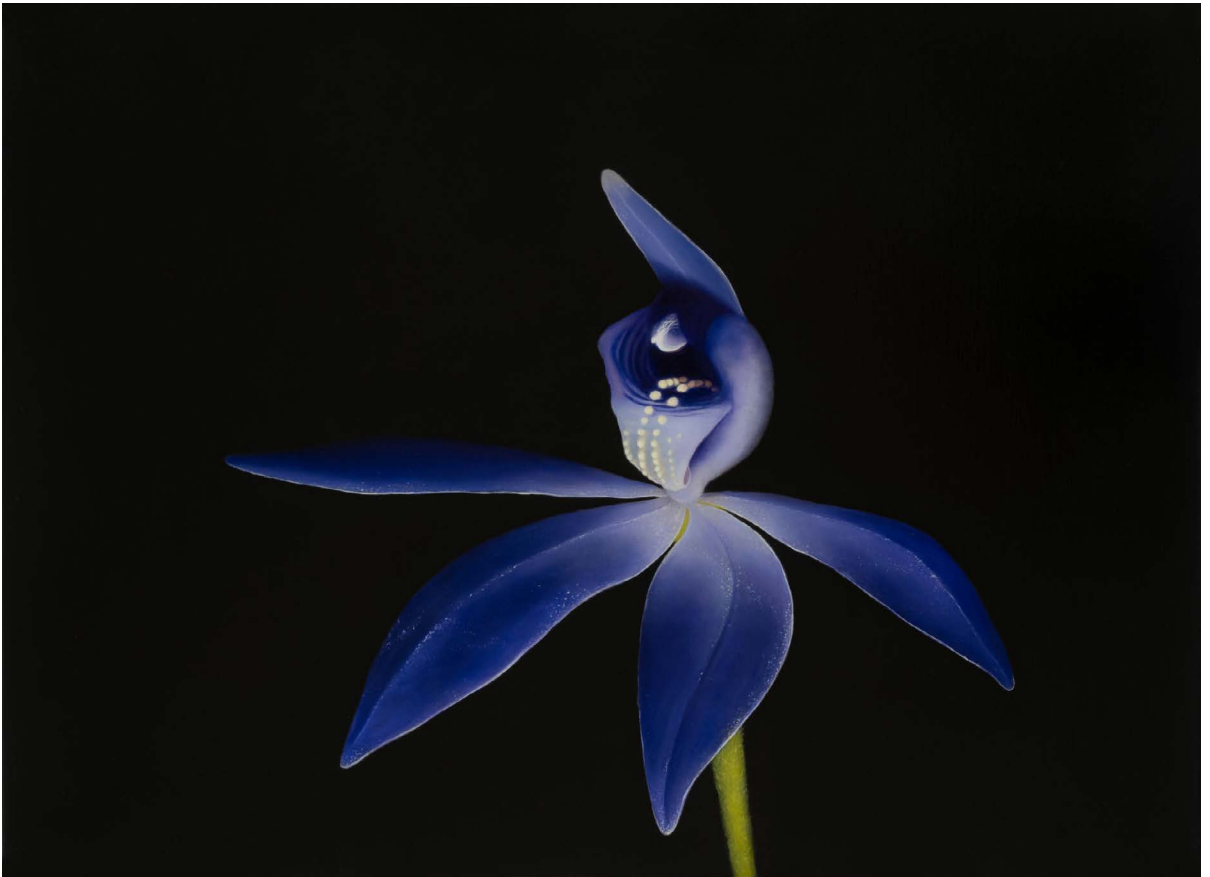
Eastern Blue Fairies ( Caladenia caerulea ) 2024 Oil on linen (framed) 41 x 56 cm