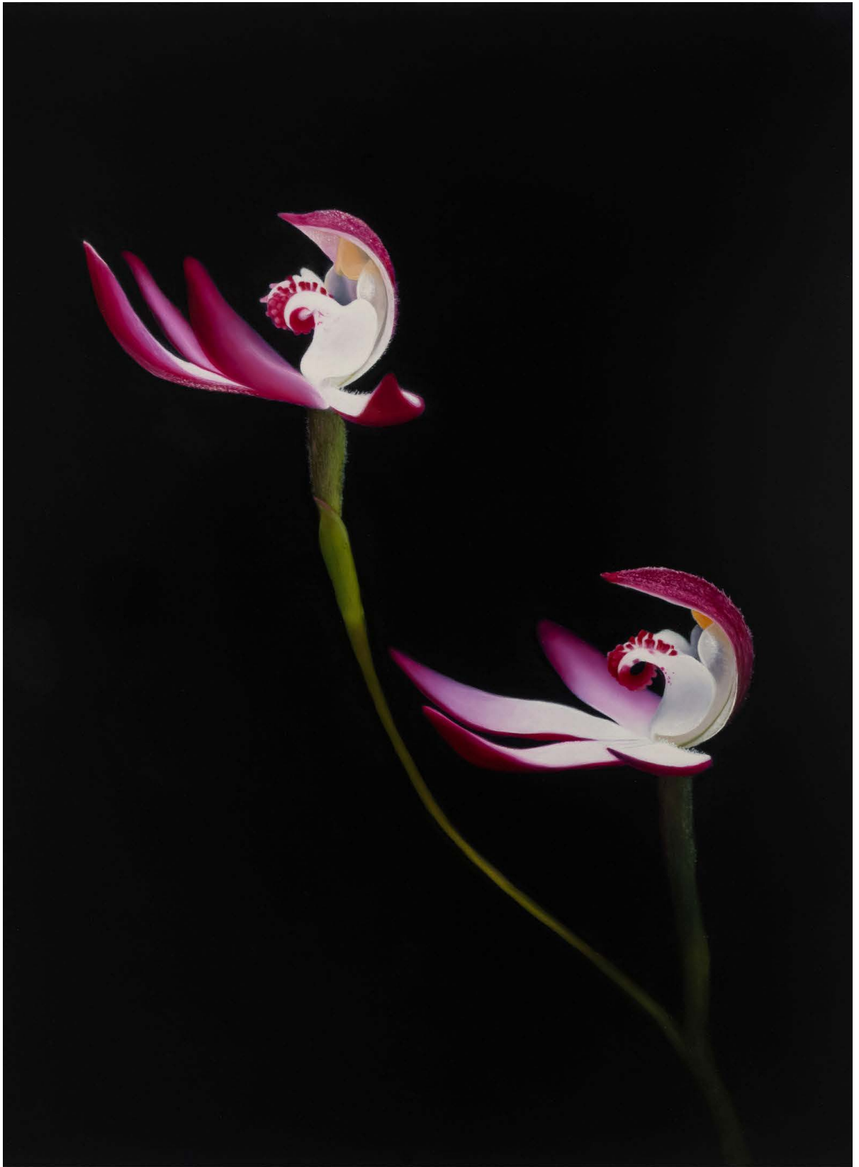
Early Caps ( Caladenia Praecox ) 2024 Oil on linen (framed) 56 x 41 cm SOLD