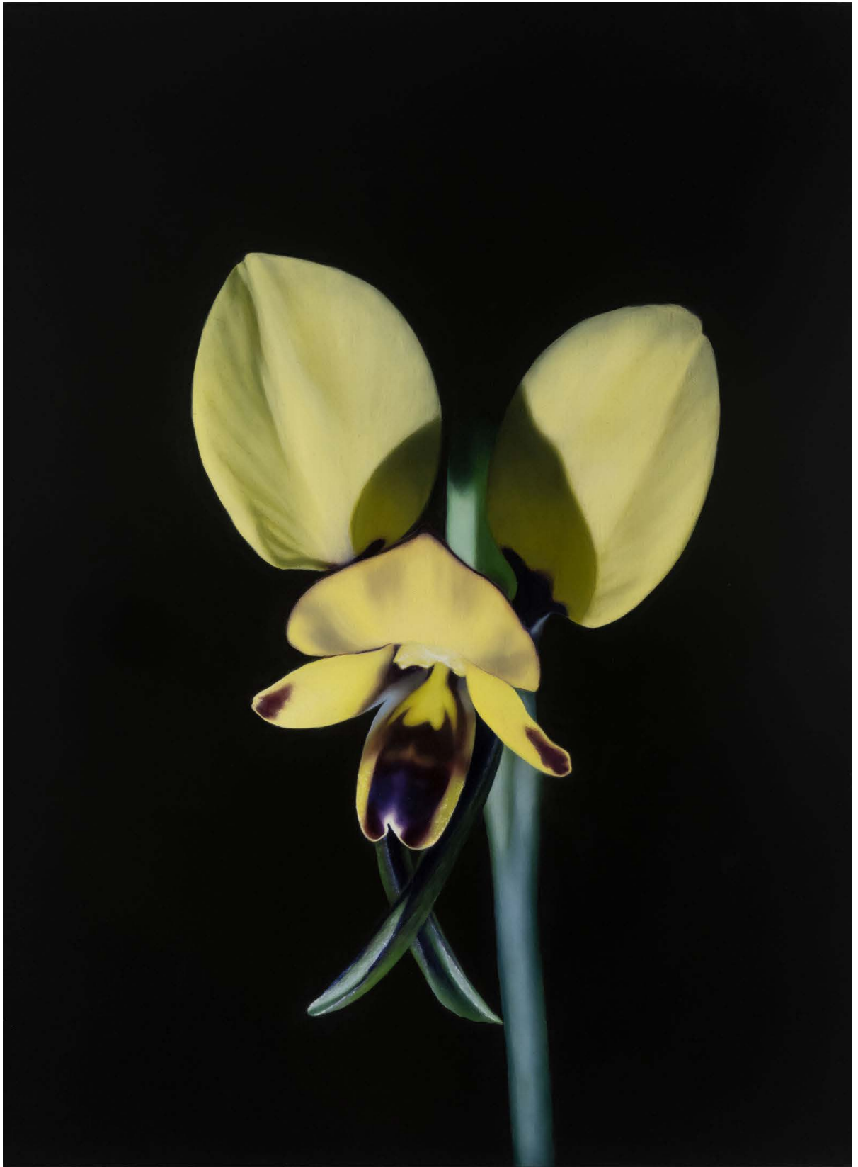
Eastern Donkey Orchid ( Diuris orientis ) 2023 Oil on linen (framed) 56 x 41 cm