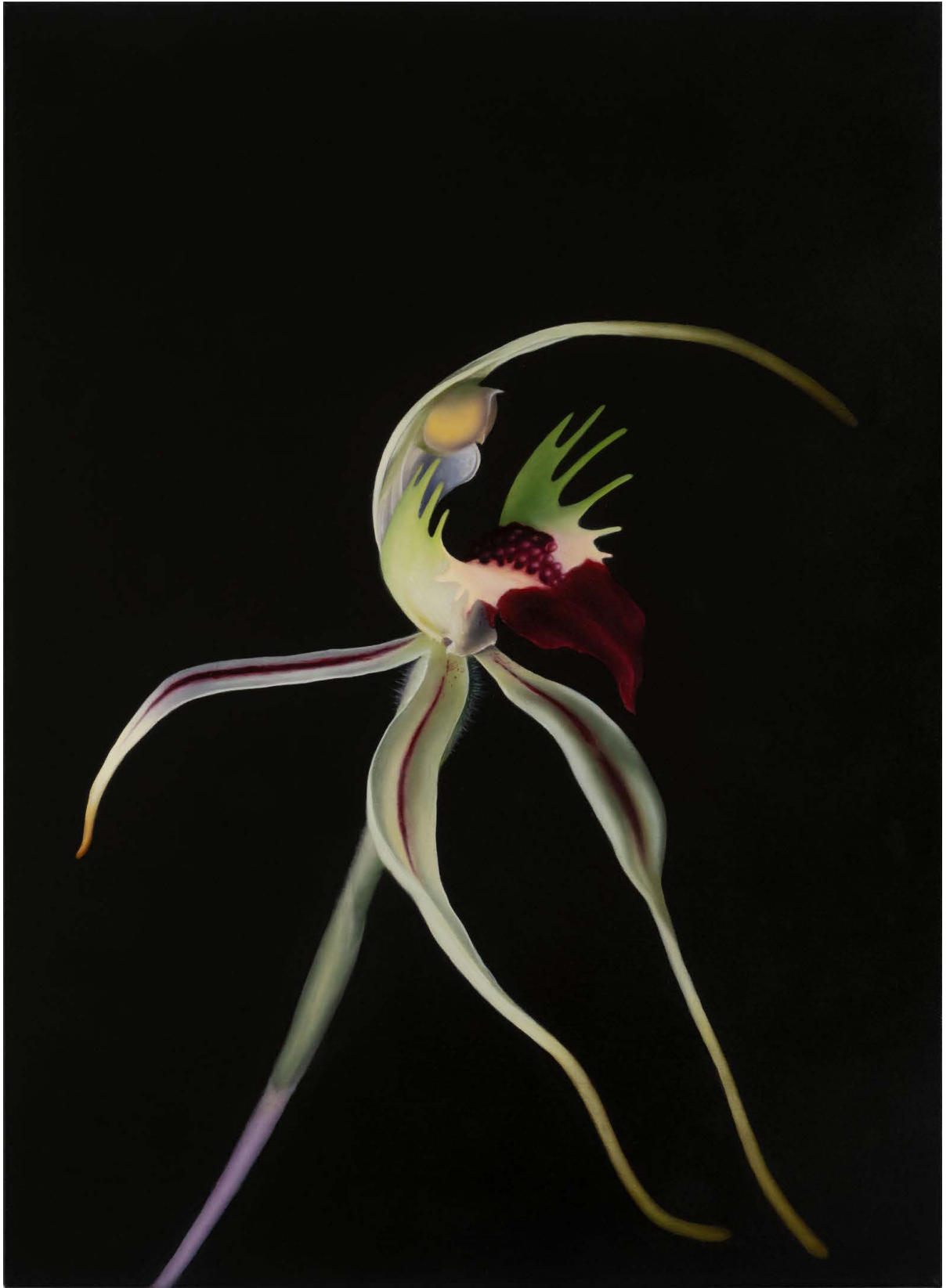
Brown-Clubbed Spider Orchid ( Caladenia parva ) 2024 Oil on linen (framed) 56 x 41 cm SOLD